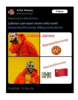
Image 20. Memes that mockig Lebron James during the Morey's conflict.

emphasized how, in their view, NBA prioritizes the revenue ahead of human rights. influential figures with global following, NBA players impacted. Their also remarks and actions surrounding the issue were constantly scrutinized, which played a role in determining fans saw individual players and the league as a whole. Some of the athletes were called out for their comments, which ultimately affected their overall popularity. Because of these things, the debate over Morey conflict on social media has become more heated. This meme protest also targeted players that netizens silent and afraid of China, for example, LeBron James, who openly criticized Morey by saying he is uneducated and misinformed.