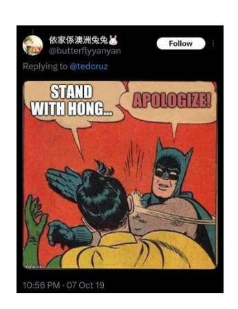
Image 18 & 19. Memes criticizing NBA during the Daryl Morey's conflict

The fans then have their creative way to protest it. Fans on social media are also protesting by using memes to mock the NBA's decision that triggered public sentiment. Memes have become a tool for NBA fans to express dissatisfaction with how the NBA handles conflicts. These fans use memes as a means of fans protest. Some believe prioritizes that the NBA apologizing and pleasing China for expressing opinions that are not mistakes.