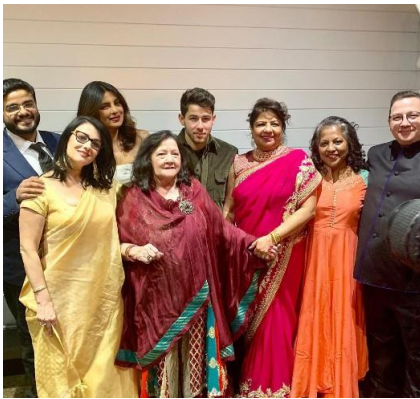
Figure 4. Chopra's post on January 28, 2019

in this case, demonstrating her capacity to adjust to a more casual Western style of dress in casual family situations. This decision supports her hybrid identity by showcasing her adaptability in balancing cultural norms with her comfort.