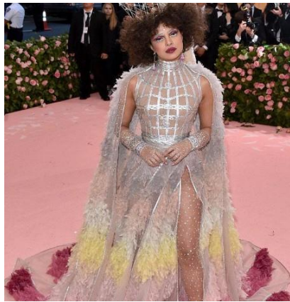
Figure 6. Chopra's post on May 7, 2019