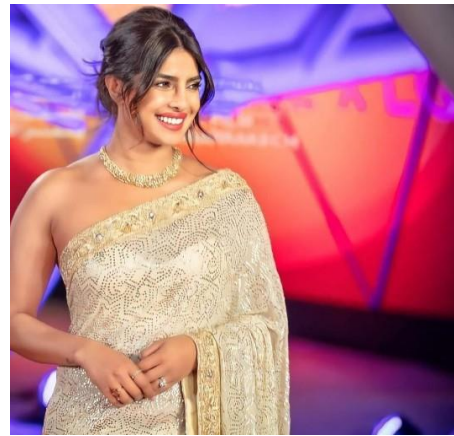
Figure 7. Chopra's post on December 6, 2019

following pictures, her hybrid identity is still visible.