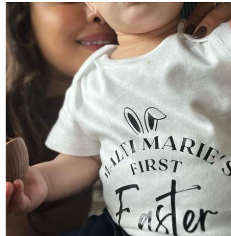
Figure 21. Chopra's post on April 10, 2023 Easter

and her daughter wearing an Easter-themed blouse.