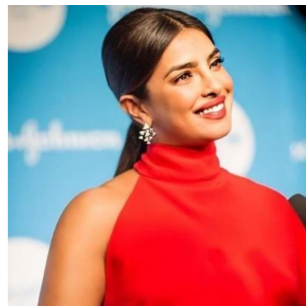
Figure 8. Chopra's post on December 5, 2019