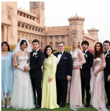
Figure 16. Chopra's post on December 8, 2018