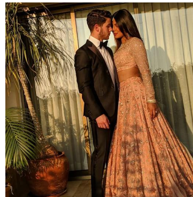
Figure 3. Chopra's post on December 12, 2018

However, since fashion keeps changing, new takes on traditional clothing have surfaced, creating what is today referred to as contemporary fashion. Modern sarees have cutting-edge materials, designs, and embellishments that provide adaptability for a range of settings and individual expressions. These contemporary looks embrace uniqueness, comfort, and authenticity while enabling women to honor their ethnic heritage.