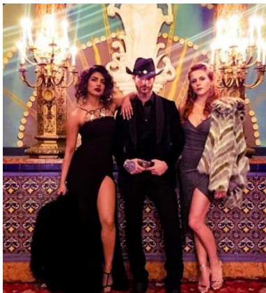
Figure 2. Chopra's post on January 13, 2018

represent an American identity, which is demonstrated by her sophisticated attire in this second picture, which demonstrates her flexibility in choosing clothing that fits the situation. Through wardrobe choices that suit various ethnic and situational needs, Chopra manages her hybrid identity, as these visual depictions show.