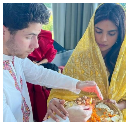
Figure 17. Chopra's post on November 5, 2021

Chopra's embrace of several cultural traditions further reflects her hybrid identity as both Indian and American. She still observes Indian holidays and customs even though she lives in the US. Chopra recounts instances on social media where she celebrates different traditions and societies she encounters. She seeks blessings at Shree Siddhivinayak and celebrates important cultural events like Diwali, Holi, and Karwa Chauth as an Indian. Her dedication to preserving her Indian heritage while living in a global setting is demonstrated by the photos she shares, which reflect these festivals.