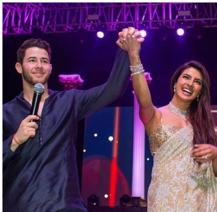
Figure 13. Chopra's post on December 2, 2018

Following that, Chopra observed the Pheras rite. The Pheras is one of the most important traditions during an Indian wedding, according to Beyond the Vows (n.d.). The pair walks around a sacred fire, an agni, or another significant spiritual object, like the Guru Granth Sahib Ji in Sikh rituals.