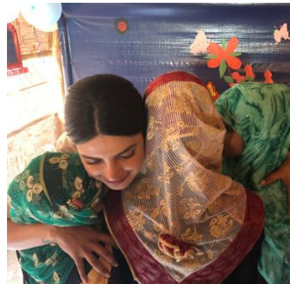
Figure 1. Chopra's post on May 24, 2018

situations when she must wear contemporary, Western clothing devoid of traditional Indian accents. Several pictures she posted on Instagram demonstrate this flexibility and her ability to use fashion in navigating different levels of society.