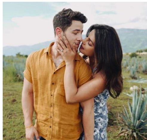
Figure 22. Chopra's post on February 14, 2021 Valentine's Day