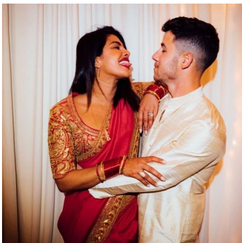
Figure 19. Chopra's post on October 18, 2019

Further, the next celebration is Karwachauth. In Karwachauth, married women follow the challenging nirjala vrat (fasting without food or drink) in devotion to their husbands' safety and well-being. From dawn until moonrise, they maintain the fast (Pallavi, 2023). Hence, by celebrating those days, Chopra's identity as an Indian is shown.