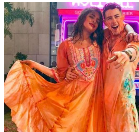
Figure 18. Chopra's post on March 7, 2020

Celebrating Diwali shows that Chopra tended to wear a saree, traditional Indian clothes. Further, in her posts, it seems that Chopra shares her moments celebrating Diwali each year.