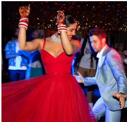
Figure 23. Chopra's post on December 1, 2022 Anniversary's day