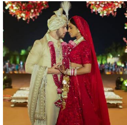
Figure 14. Chopra's post on December 4, 2018

Chopra's traditional wedding ritual, The Pheras