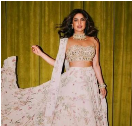
Figure 9. Chopra's post on November 4, 2021

and surrounded by love.❤️🌟". Her caption shows that she is not only undergoing a hybrid identity through her appearances but also extends beyond her fashion choices, which is also reflected in her self-presentation and communication.