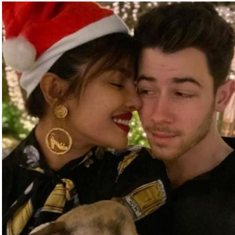
Figure 20. Chopra's post on December 26, 2020 Christmas

Instagram on several occasions. She has shared several posts with a Christmas theme, including image 20. Chopra eagerly participates in the Christmas festivities in these pictures, showing her respect for her husband's Christian beliefs. She is also spotted spending time with her spouse while wearing loose, comfy clothing, emphasizing the holiday's laid-back and personal vibe.