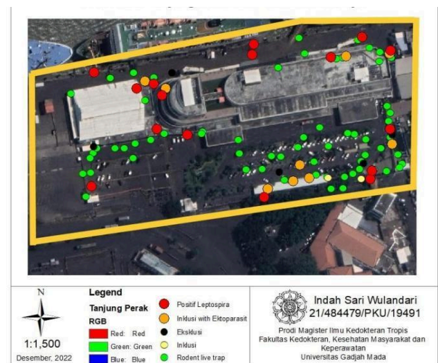
Figure 1. Map of the Distribution of Rats Infected with Pathogenic Leptospira Bacteria in the Work Area of Tanjung Perak Port of Class I KKP Surabaya

The traps in the Tanjung Perak Port working area's perimeter area, as shown in Figure 1, are inside the yellow line. They are located in the outer building of the Gapura Surya Nusantara passenger terminal. The environment around the terminal contains bushes, gutters, piles of used goods, and standing water in the parking area (Figure 1).