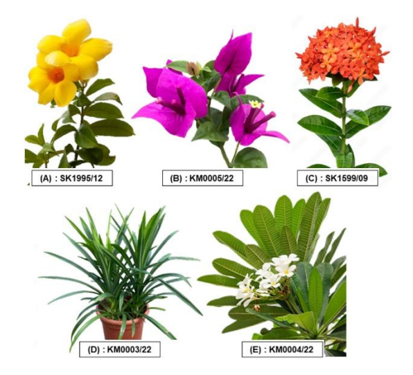
Figure 1. Ornamental plants selected for this study with voucher number. (A) Allamanda cathartica , (B) Bougainvillea glabra , (C) Ixora coccinea , (D) Pandanus amaryllifolius , and (E) Plumeria obtuse .

The five selected domesticated ornamental leaf plants were collected around Kuala Selangor, Selangor, Malaysia. Fresh mature leaves of these ornamental plants were collected from domesticated gardens within the research area and each plant specimen was identified by a botanist. Voucher specimens were deposited in the Herbarium of the Institute of Bioscience, Universiti Putra Malaysia (Figure 1).