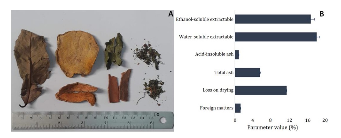
Figure 1. The macroscopic observation (A) and the physicochemical properties values (B) of the crude drugs of the antidiabetic polyherbal formulation from Tegal

For the evaluation of glucose uptake, L6 myoblasts were seeded at a density of 2 \times 10^4 cells/well in DMEM supplemented with 10% FBS and 1% P-S in a working volume of 500 \mu l. The cells were further maintained in DMEM with 2% FBS and 1% P-S as the differentiate media after reaching 90% confluence and were allowed to differentiate into mvotubes for at least seven days, with media changing every other day. The myotubes were incubated in differentiated media containing water and ethanol extracts of the formulation at a concentration of 20 µg/mL for 24 hours. Insulin (at 100 nM: Eli Lilly, US) and differentiate media (with 0.5% DMSO) functioned as the positive and control group respectively. The media was collected, and the volume was corrected to 500 \mu l with sterile water. Glucose Assay Kit (Abcam, UK) was used to analyze the glucose level in the media following the manufacturer's protocol. Also, the absorbance was measured at a wavelength of 570 nm. The glucose uptake in cells treated with each extract concentration was calculated bv subtracting the final glucose level from their initial counterparts. Subsequently, the glucose uptake stimulatory activity of each sample was relatively calculated as the percentage of the control group (Inthongkaew et al., 2017).