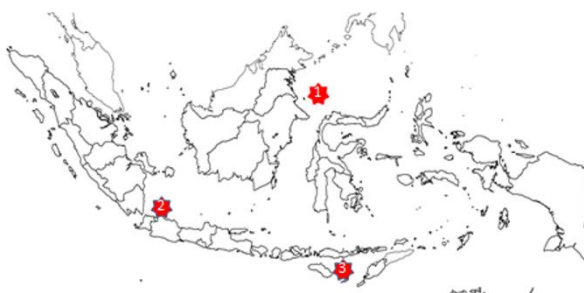
Figure 1. Sampling Location: 1 Makassar Strait (1°24.162'1.41022" N, 119°31.345'118.91080" E /150 m), 2. Seribu Island (5°51'09.3"S 106°36'58.7"E), 3. Sumba (10°05'27.6"S 119°38'52.6"E)

The solvent used for extracting active substances were ethyl acetate, acetone, and methanol. The instrument used for analyzing compounds was GC-MS.