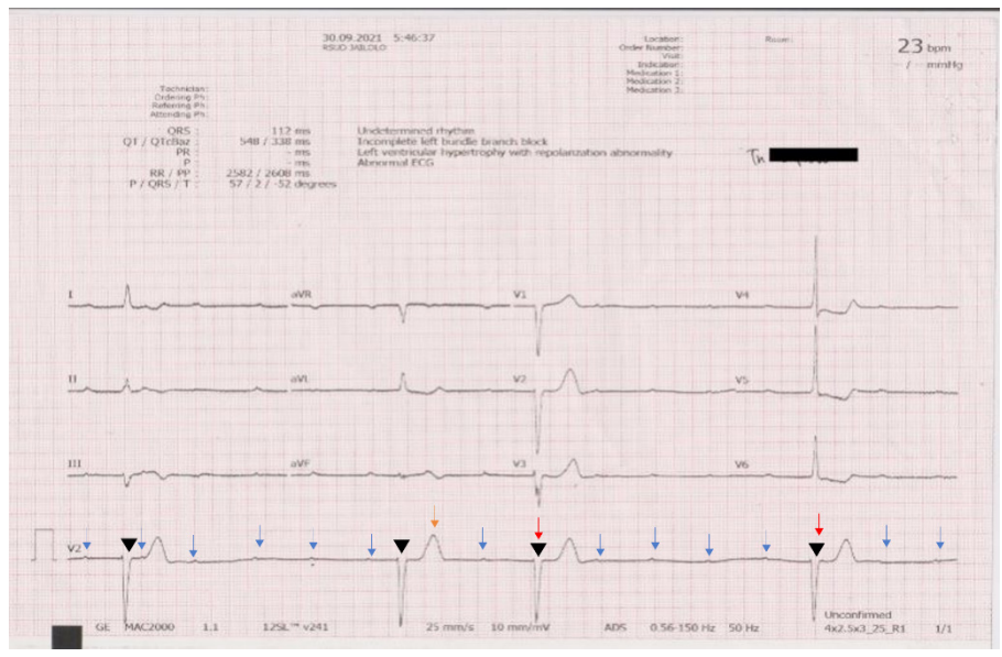
FIGURE 1. Initial ECG at Emergency Department presented total AV block with junctional escape rhythm. Blue arrow: visible P wave; orange arrow: possible P wave buried in T wave; red arrow: possible P wave buried in QRS wave; black arrowhead: narrow QRS wave as junctional escape wave.

The electrocardiogram (ECG) showed a TAVB pattern with ST-segment depression in leads V4-V6 (FIGURE 1). Two times, 1 mg of atropine sulphate was administered, but there was no improvement in the rhythms. The fluid challenge of 250 mL crystalloid solution was then conducted after signs of congestion were excluded by lung auscultation. After the first fluid challenge, the BP was slightly increased (70/40 mmHg), and then the second fluid challenge was given.