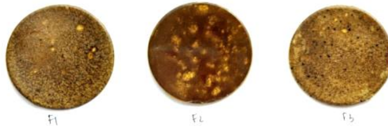
Figure 2. The patches of salam leaf ethanolic extract with variation ratios of PVA-alpha cellulose of 1:1 (Formula1); 3:1 (Formula 2); and 1:3 (Formula 3).