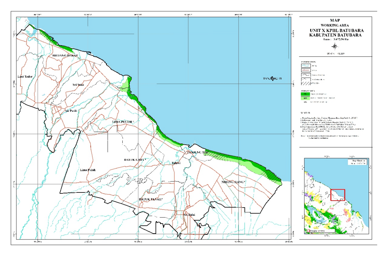
Figure 1. Working Area Map of Unit X KPHL Batu Bara